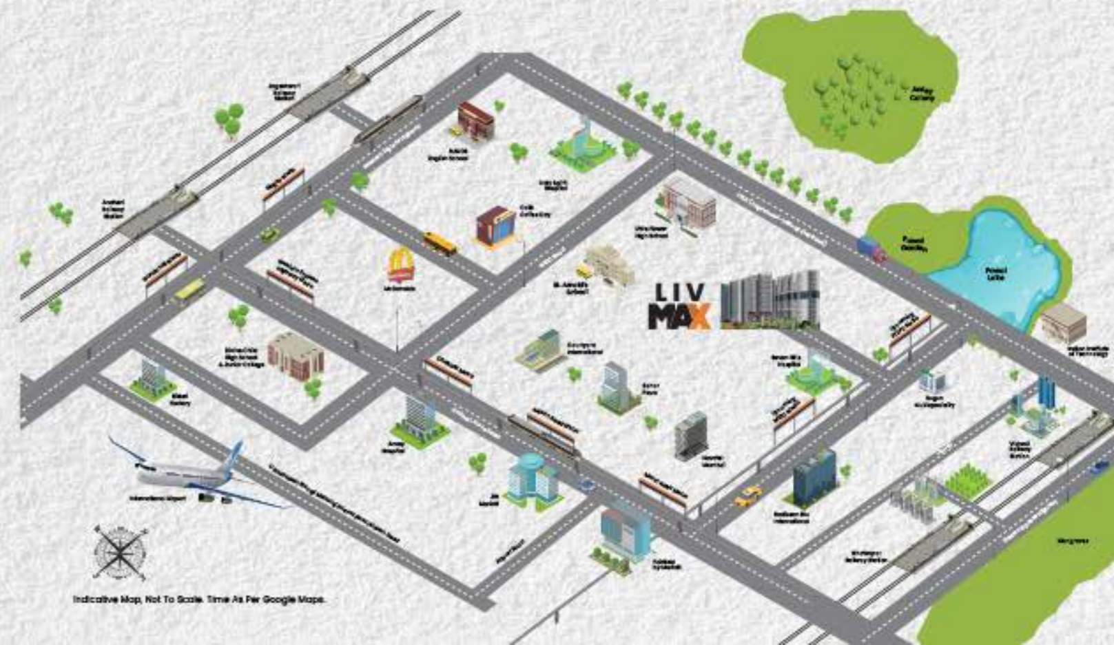
Indicative Map, Not To Scale, Time As Per Google Maps.